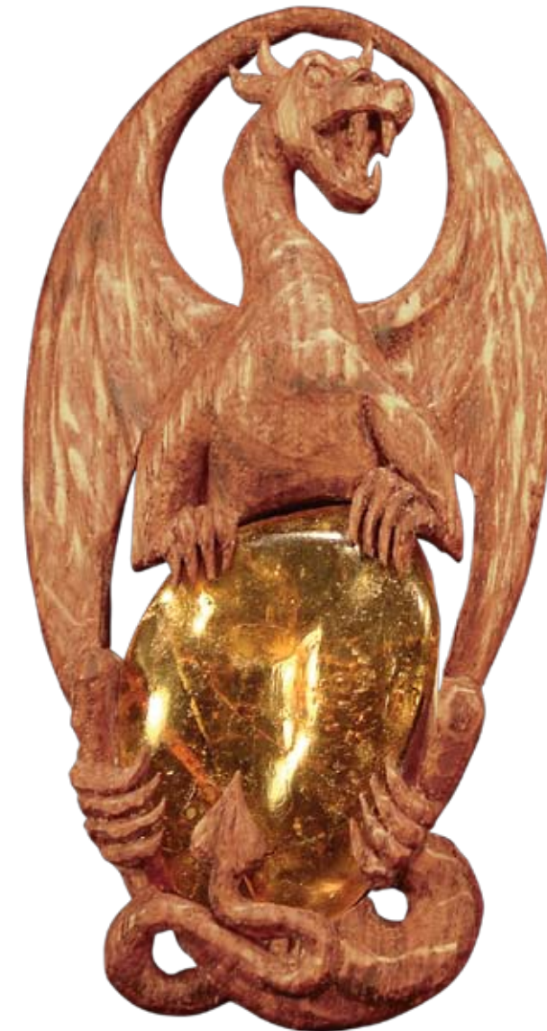
TREASURE DRAGON, ¾" x 2½" x 4¾", Scottish brown oak with Baltic Amber.