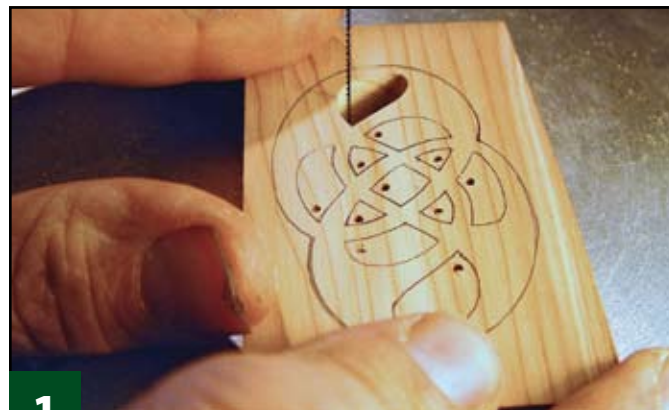
1 Cut the spaces. Drill a \frac{1}{16} "-diameter blade-entry hole in each negative space. Feed a #2 scroll saw blade through the holes and cut the frets.

To get started, use graphite paper and a stylus to trace the pattern onto a piece of \frac{3}{8} "-thick wood. Apply the oil finish after the carving is complete and the pin back is secured. Be sure the pin is secured first; the epoxy will not stick to an oily surface. Let the brooch soak overnight in a container filled with tung oil.