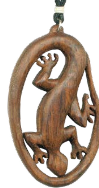
LIZARD, 1¼" x 2½", English walnut.