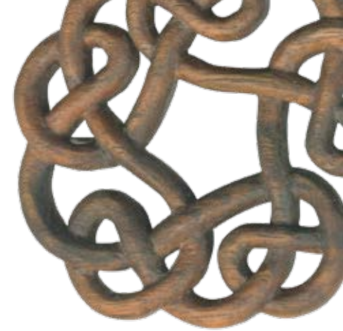
PENTICOIL, 2"-diameter, English walnut.