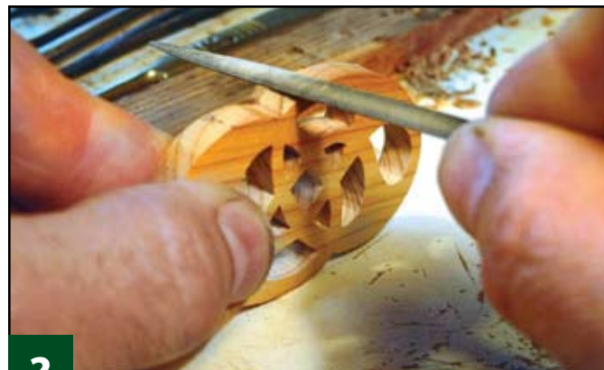
2 Cut the perimeter. Cut along the outside line, then smooth all the edges with a small jeweler's file. Be careful not to create any gouges or irregularities.