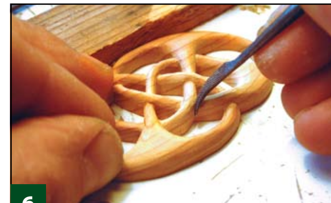
6 Remove the knife marks. Use a small file to smooth the edges. A small riffler works well in the corners.