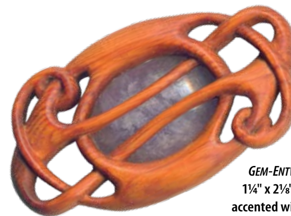
GEM-ENTWINED BROOCH, 1¼" x 2½", English yew accented with amethyst.