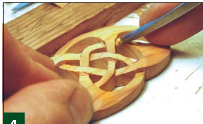
4 Define the crossovers. Shave wood from the outside edges inward, up to the stop cuts at each of the crossover points made in step 3. Do not cut beyond the stop cuts.