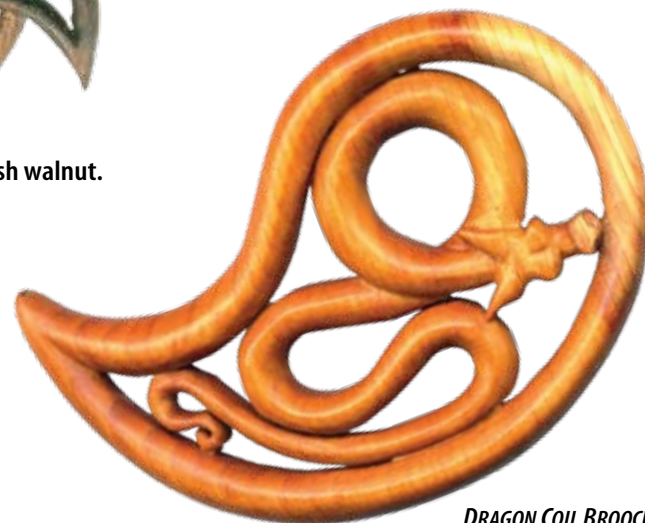
DRAGON COIL BROOCH, 3" x 2", English yew.