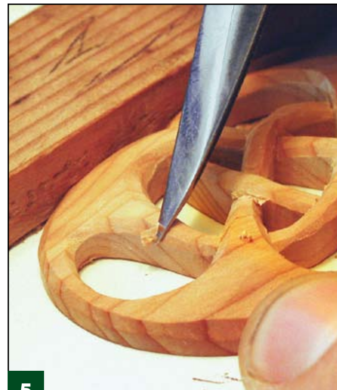
5 Round the inner and outer edges. Use a detail knife to create smooth, round edges on the whole piece.