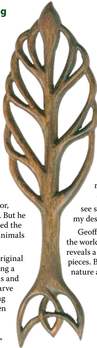
ELVEN TREE, 1" x 3½", English walnut.