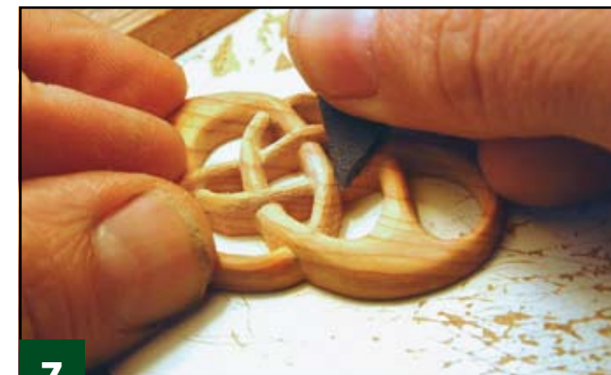
7 Finish smoothing the brooch. Sand the entire piece with 240-grit silicon carbide sandpaper. Then rub the piece down with extra-fine synthetic steel wool.