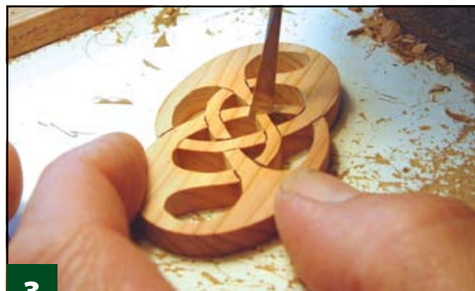
3 Outline the crossover points. Mark the areas where the knotwork passes over or under another section. Make vertical cuts on these lines with a gouge.